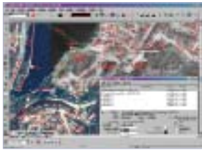
Bentley PowerMap provides high-performance imaging capabilities via Raster Manager integration.