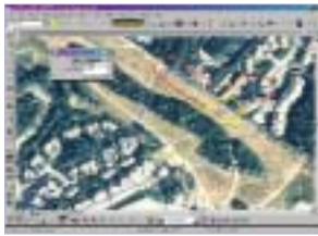
Geospatial querying tools support "what if" and other mapping workflows.